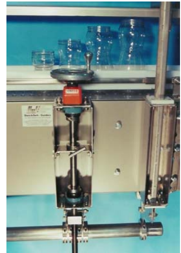
MASS AIR ACCUMULATION