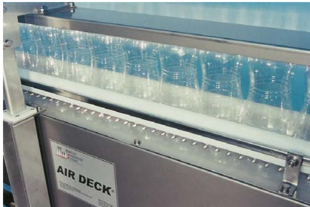
SINGLE FILE APPLICATION